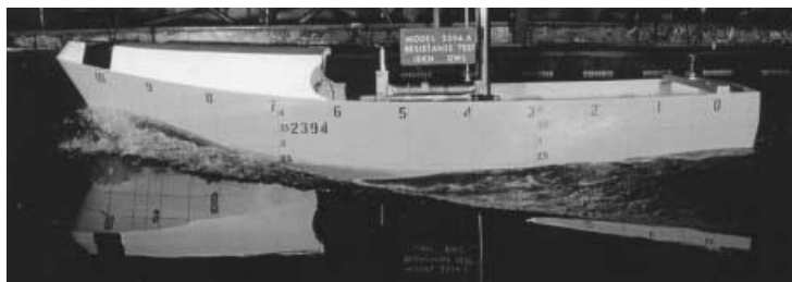
Figure 3. Seakeeping tank at the El Pardo Model Basin, Madrid, Spain. (Nuno Fonseca)

tests, where the model is towed in regular and irregular waves to measure the induced motions and added resistance to the advance due to the waves; and manoeuvring tests where forced horizontal motions are imposed to the model to obtain the hull manoeuvring characteristics.